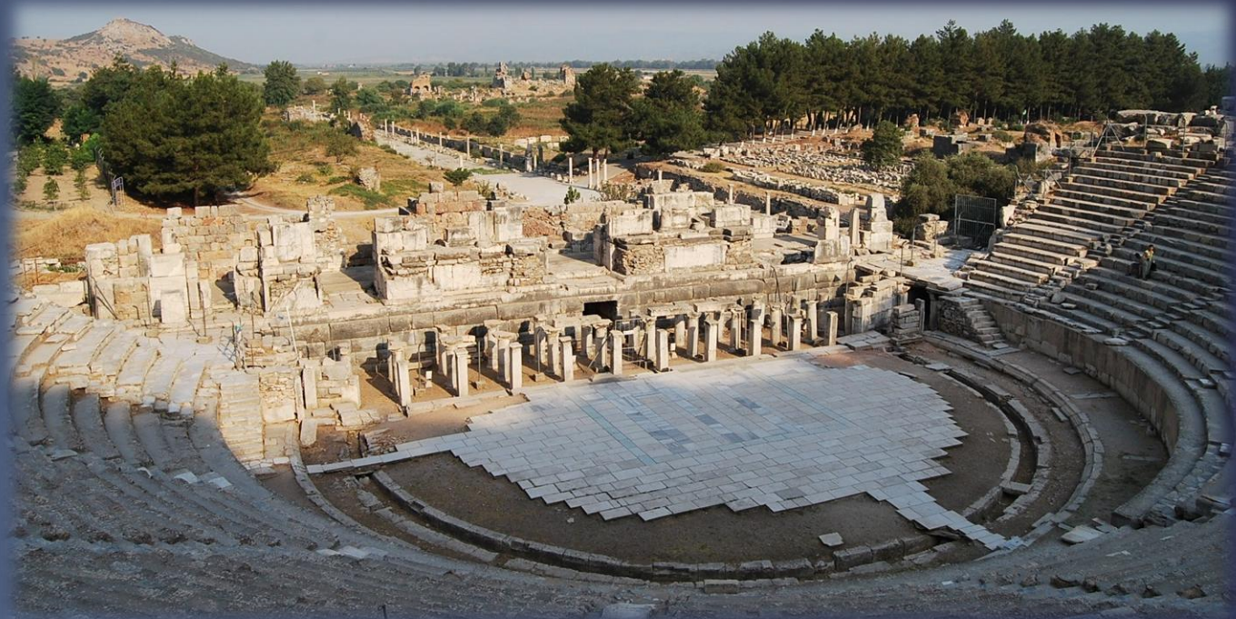
Theater in Ephesus